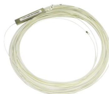
PLC Splitter Mini Box without connectors