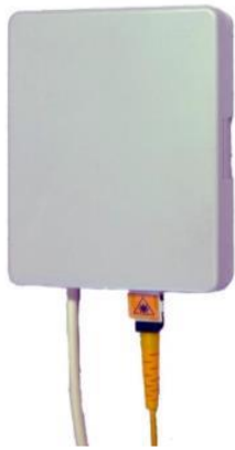
Subscriber socket CTB2-A

Socket CTB2-A are designed as a termination point of subscriber's fiber optic line