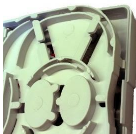
Subscriber socket CTB2-A /highlighted locking catch/