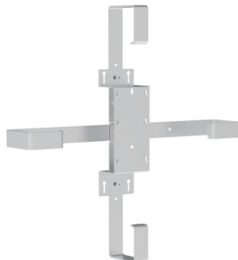
Cable storage frame with FA-MP1/FA-MP6 mounting plate