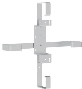
Cable storage frame with FA-MP5 mounting plate

Cable storage frame FA-SZ-U1 series dedicated for arranging cable stock in the FTTx access optical networks.